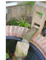
< A bespoke Japanese style birdbath made from zinc plates, chain and copper pipe and water feature made from an oak sleeper