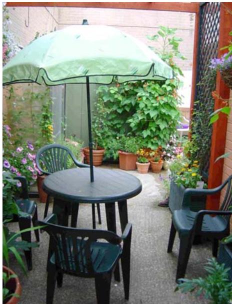
A place to sit and chat under the multi-coloured pergola

The design challenge was to create an oasis in a heavily built up and oppressive area that enabled the residents to feel that they were in a real garden.